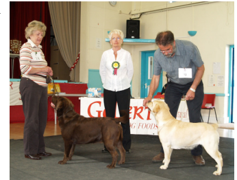
Best & Reserve Best in Show